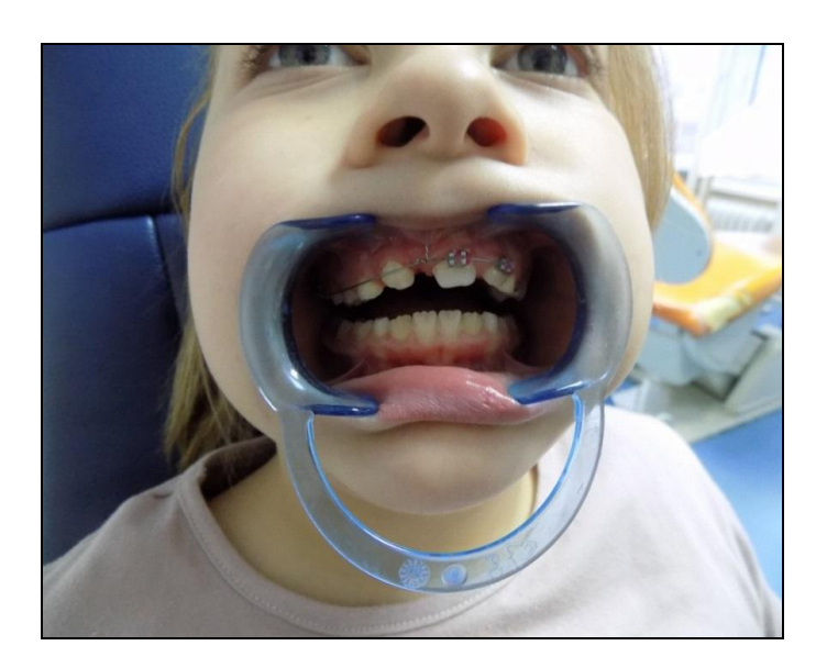
Figure 1. Fixed device with twisted wire installed after surgical interventions

Orthopantomography as well as occlusal images play a key role in diagnosis, therapy planning and type of therapy, as well as in the prognosis of very complex and complex cases in which two-dimensional images are not able to accurately locate certain and above details (Figure 2a). The previous two-dimensional images have replaced new technologies for imaging the orofacial region, where in such cases CBCT is the method of choice in making an adequate diagnosis, prognosis and final treatment plan. The superiority of the CBCT technique for imaging impacted teeth was presented in our case, which greatly facilitated the consultations of orthodontists and surgeons, and dispelled unknowns and possible doubts that existed during the analysis of both the patient and two-dimensional images. (Figure 3). Also, CBCT images provided the orthodontist with a complete analysis of how and in what way to approach orthodontic therapy after surgery.