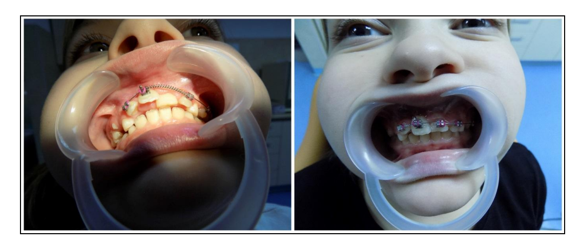
Figure 4. Intraoral photograph after 9 months of surgical therapy

removed and replaced with a bracket for the right central incisor, the .014" Ni-Ti arch was restored and ligation with rubber bands was performed. After 9 months of orthodontic therapy, the dilated central incisor on the right side was brought to the dentition where it took another two months to obtain an adequate incisal plane correlated with the incisal edges of the lateral incisors, and 1/3 of the central incisor on the left side had to be restoratively replaced, which was another challenge (Figure 4). The repositioned incisor had slightly irregular gingival contour. The posttreatment radiograph (Figure 2b) showed no resorption of roots, no alveolar bone loss and no resorption of the root of lateral incisor on the right side who suffered the greatest force of orthodontic traction during the liberation of the dilated central incisor.